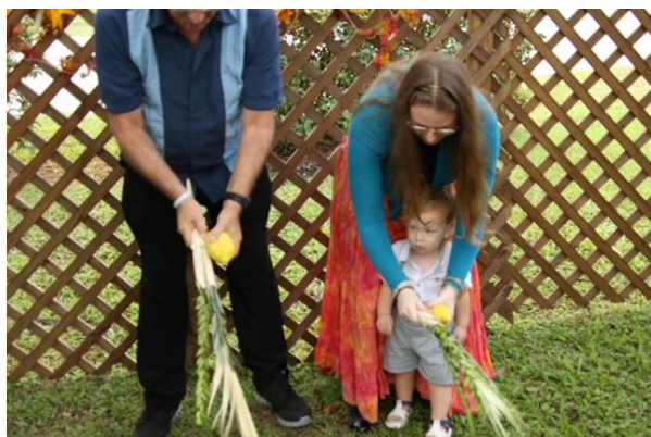
We train them young !!!