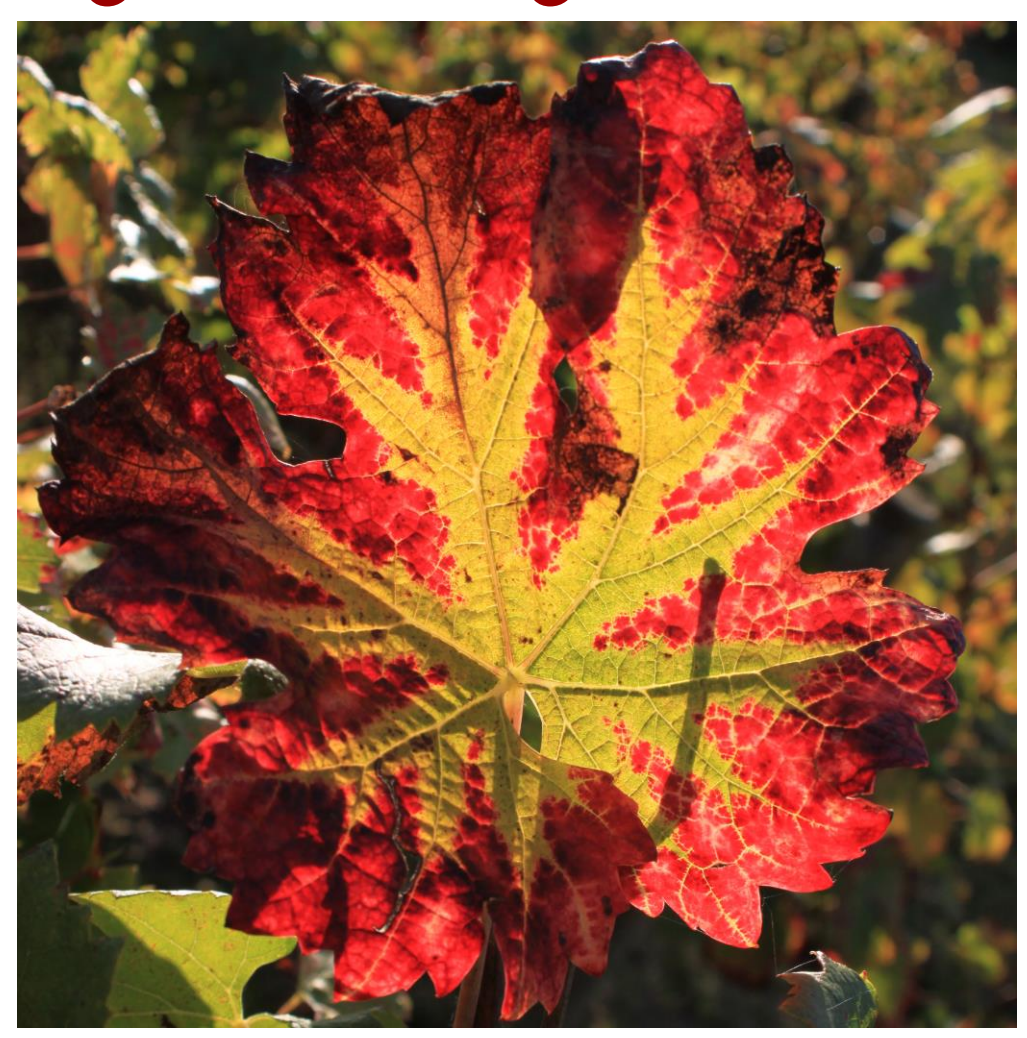
Hapy Thanksgiving Happy Chanukah